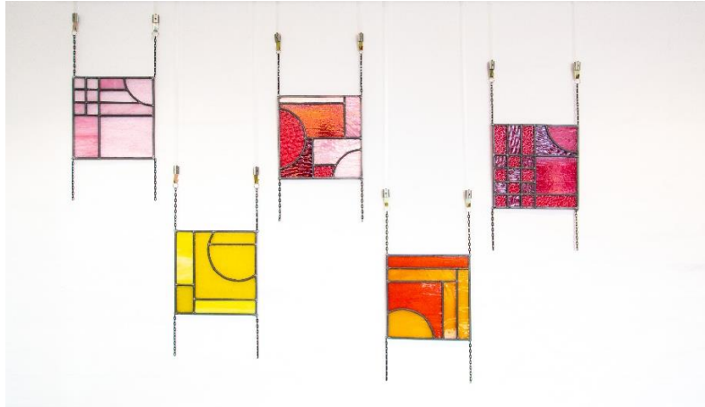
Glass by Cert III Graduate Aoife Fitzpatrick