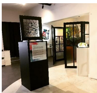
Australian Centre for Glass Design

GLAAS Inc. works to promote the use of glass in art, architecture and construction in Australia; to protect the rich heritage of stained glass in Australia and to ensure the skills to conserve this heritage are retained; to encourage delivery of trade training and visual arts qualifications in glass; and to support the community of contemporary glass artists, designers, students and makers in Australia. Also, to engage with the community to bring the opportunity to learn glass techniques to as many people as possible, including vulnerable people and disadvantaged groups such as First Nations Peoples, homeless people and those with physical disabilities and/or mental health challenges.